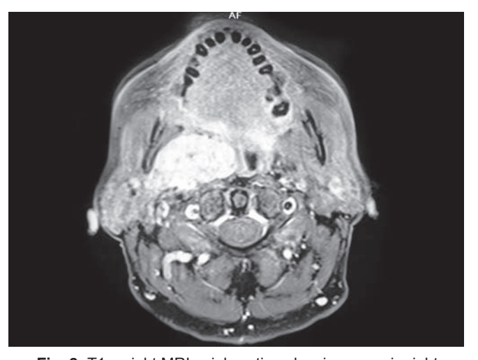
Fig. 2: T1-weight MRI axial section showing mass in right parapharyngeal space

and histologic diagnosis. In our study, out of 16 cases, 14 (87.5%) were benign, while 2 (12.5%) were malignant on histology. Out of 16 cases, cytological diagnosis was histologically confirmed in 13 (81.2%) cases, while cytological diagnosis was changed in 3 (18.7%) cases. Two cases diagnosed as adenoid cystic carcinoma on cytology later on turned out as pleomorphic adenoma and carcinoma ex-pleomorphic adenoma on histopathology. One case