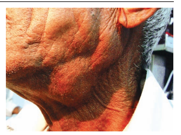
Fig. 1: Clinical photograph showing left cervical swelling

The total numbers of patients were 16. Out of these, 9 (56.2%) cases were males and 7 (43.7%) were females. There was a male predominance. Age ranged from 16 to 62 years, and the average mean age was 38 years. In our study, maximum patients fell within the age group 40 to 50 years. The most common presenting symptom was neck swelling in 14 (87.5%) cases followed by oropharyngeal swelling in 10 (62.5%) cases, and the most common examination finding was oropharyngeal bulge seen in all the 16 (100%) cases followed by cervical swelling in 12 (75%) cases (Fig. 1). Table 1 shows the presenting symptoms and examination findings. One case presented late with acute respiratory obstruction. An MRI (Fig. 2) was done in 14 (87.5%) cases and contrast CT scan in 6 (31.25%) cases. Four (25%) cases underwent both CT and MRI scan. In 10 (62.5%) cases, the tumor was in the pre-styloid compartment and in 6 (31.25%) cases in the post-styloid compartment. No adjacent bony erosion and intracranial extension were found in all the cases. In 12 (75%) cases, FNAC was done directly from readily accessible lesions, while in 4 (25%) cases, CT-guided FNAC was performed and a cytologic diagnosis was made. Table 2 shows the correlation between the cytologic