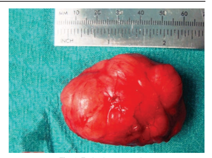
Fig. 4: Excised tumor specimen