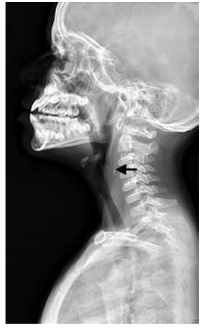
Fig. 1: Plain radiograph neck lateral

He underwent diagnostic direct laryngoscopy with esophagoscopy, but foreign body could not be visualized nor palpated. There was no edema or raw mucosa in the posterior pharyngeal wall. There was mucosal abrasion and a deep pocket seen in the left pyriform fossa with minimal pus within it. We used zero degree telescope into the pocket to visualize but no foreign body was seen. It was postulated that, the pocket was probably made during the previous esophagoscopy. It was then decided to insert a Ryle's tube, abort procedure and to take him up after computed tomography (CT) imaging to confirm position of the foreign body. Computed tomography neck with oral contrast (Figs 2A and B) was done which showed the foreign body to be at C3-C4 vertebral level but in the retropharyngeal space.