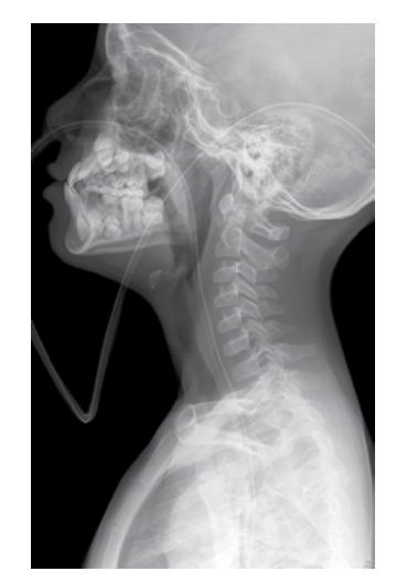
Fig. 5: Postoperative plain radiograph neck lateral