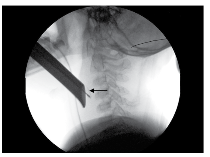
Fig. 4: Fluoroscopy showing foreign body being localized