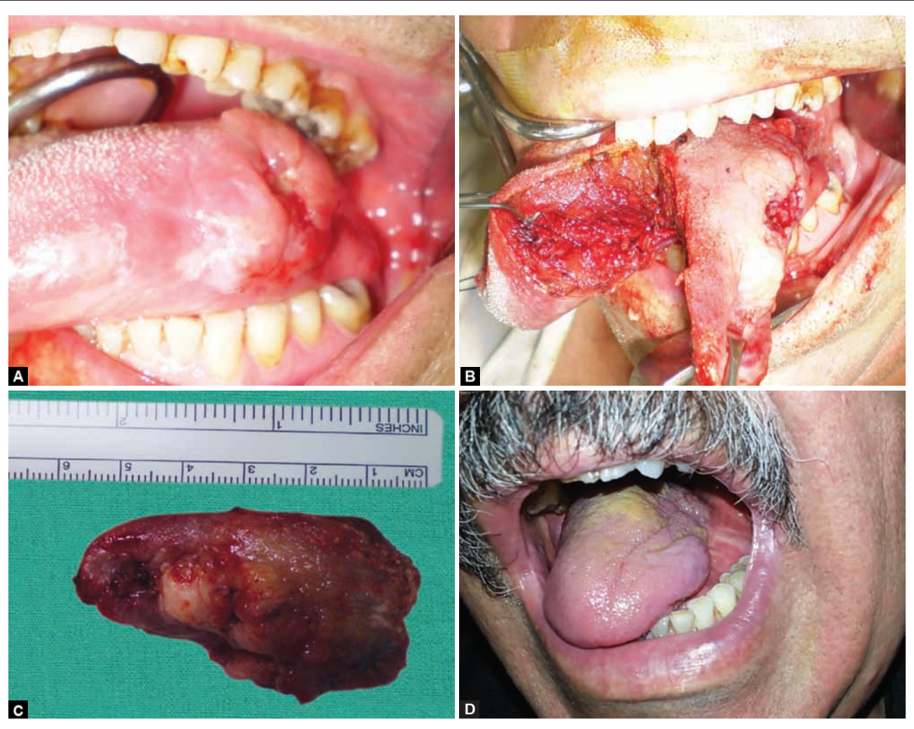
Figs 1A to D: (A) Malignant tongue ulcer, (B) partial glossectomy, (C) removed specimen and (D) healed tongue (9 months postoperative)