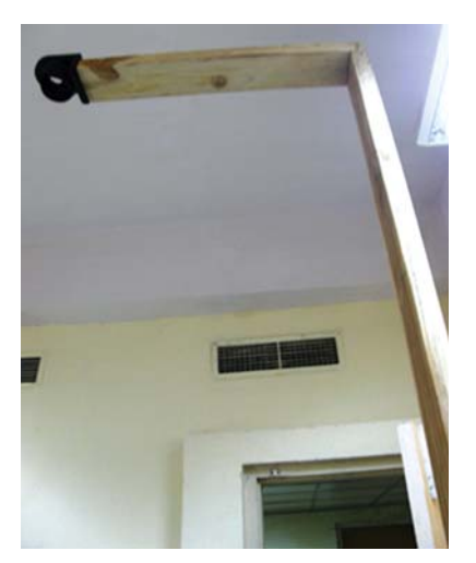
Fig. 11: The wooden frame for the 'top' camera, which reaches a height of eight feet and takes the patient's images from above. Thus using a combination of the 'side' and 'top' cameras, one can easily determine the orientation of the patient in both horizontal and vertical planes. The CCTV cameras used for this purpose are easily available and also have a 'night-vision' facility for patients who are not comfortable with the blindfold, and would rather prefer to stand in darkness to simulate the 'eyes-closed/blindfold' module

advocate the 'feet together' stance, while others advocate the 'feet apart' stance. Yet others propose that the arms be crossed across the chest.