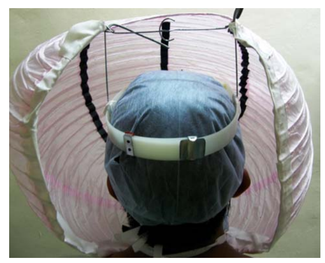
Fig. 8: The dome as seen from the outside after being worn by the patient