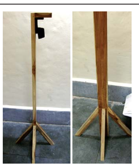
Fig. 10: To the left, note the simple wooden stand constructed to mount a CCTV camera (the black camera frame is seen) which will serve as the 'side' camera. To the right, note the base of the wooden stand that makes it extremely stable. The camera frame is at an approximate height of five feet