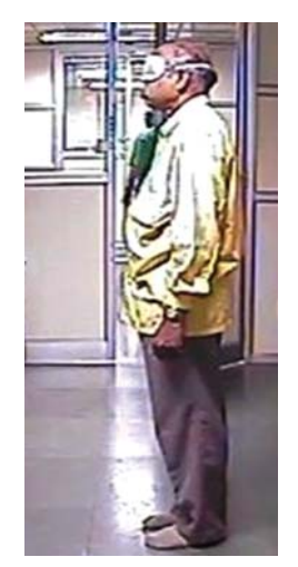
Fig. 2: Situation 2