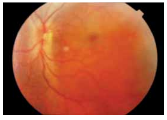
Fig. 1: Fundus picture showing a vertically oval disk with hyperemia and blurred margins

MRI also confirmed the findings showing that the cyst had a hyperdense rim with septa running through the cyst