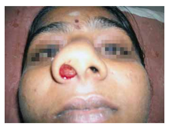
Fig. 2: Basal view showing polyp filling right nostril