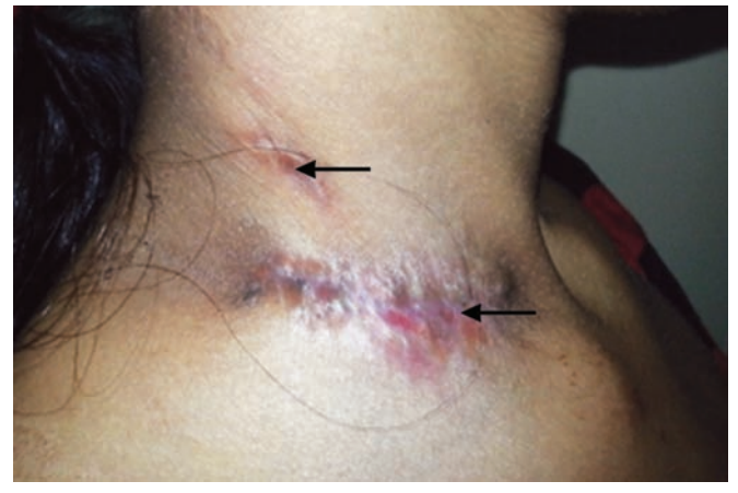
Fig. 5: Postoperative healing and scars from previous lesions (arrows)

Section was positive for acid fast bacillus which confirmed our clinical diagnosis of cervical tuberculous lymphadenitis with cutaneous involvement (secondary scrofuloderma). The patient was referred to the nearest DOTS center for treatment. Patient is on regular follow-up and lesion healed completely (Fig. 5).