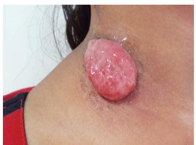
Fig. 2: Granular reddish surface