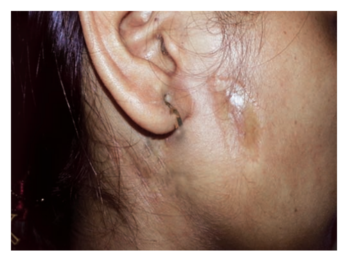
Fig. 3: Scar from previous lesion

An ultrasound scan of the patient's neck reported the swelling 5 \times 4 cm involving skin and it was highly vascular. The radiologist also made a note of few lymph nodes around it of varying sizes on the same side. The other side of the neck and other structures like thyroid and vessels were normal. Keeping in mind the antenatal status of the patient, since no definite therapy could be started wedge biopsy of the lesion was taken under local anesthesia for the diagnosis which, however, reported nonspecific inflammation and pathologist recommended excision biopsy. Antenatal check up of the patient including ultrasonography was within normal limits. Diagnosis of inflammatory pseudotumor of pregnancy was also kept in mind owing to exaggerated proliferative changes in response to pregnancy hormones.