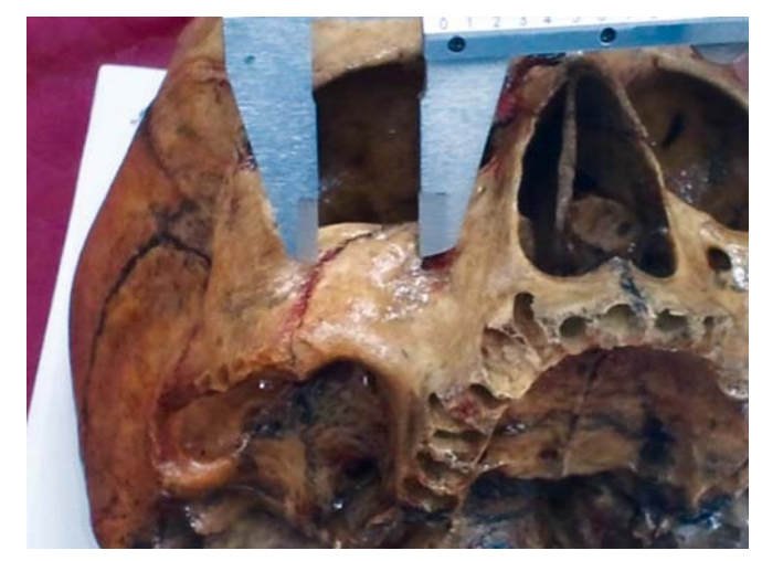
Fig. 3: Measurement of the distance between the center of the IOF and zygomaticomaxillary suture