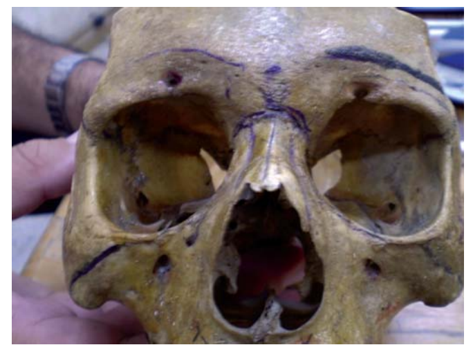
Fig. 5: Skull showing the inferomedially placed accessory IOF in the right side only and the both main IOF is ovoid and its opening directed downward and medially in both sides