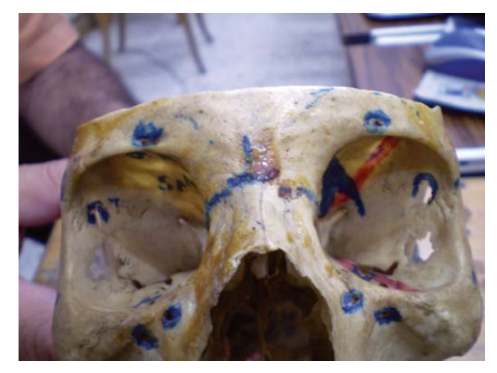
Fig. 4: Skull showing double accessory IOF, both main IOF are rounded and directed medially, both accessory IOF are supramedially directed

*Significant difference between genders at p < 0.05