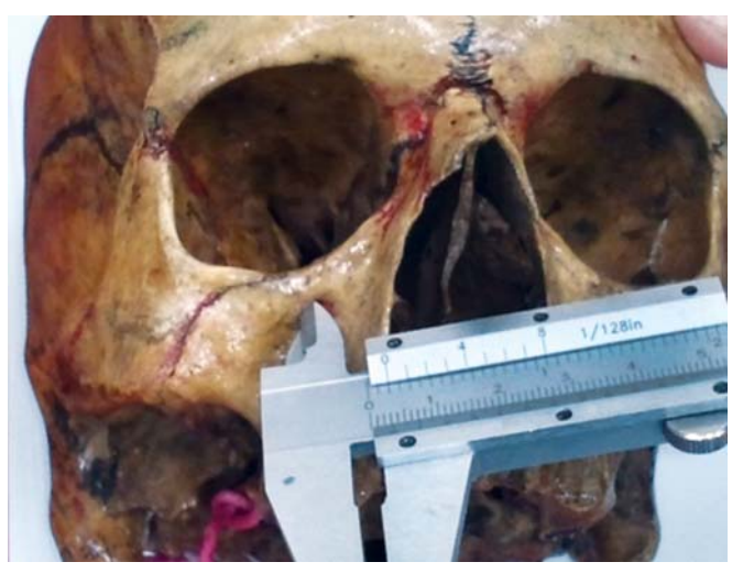
Fig. 1: Measurement of the transverse diameter of the IOF

The direction of infraorbital foramen was infromedially in 78.1% in male skulls and 88.9% in female skulls and medially directed in 21.9% in male skulls and 11.1% in female skulls with no significant difference between the genders (Tables 2 and 3).