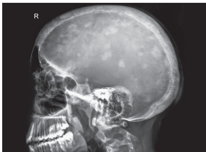
Fig. 1: X-ray skull showing typical salt and pepper appearance