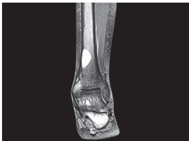
Fig. 3: MRI foot showing lytic lesion in femur