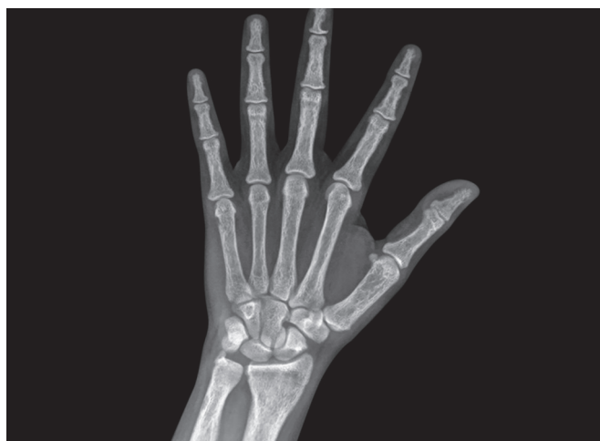
Fig. 2: X-ray of hand showing bone erosion and resorption of phalanges