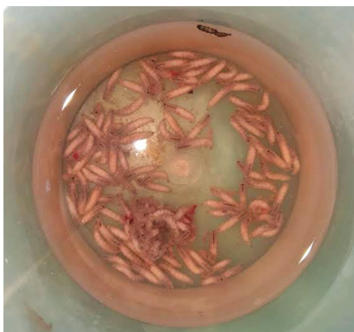
Fig. 2: Animate foreign bodies (myiasis)

anterior rhinoscopic examination, only mucous secretions are seen in both nostrils and the foreign body was not visualized. So an emergency radiological examination was done by taking the X-ray skull anteroposterior (AP) view and lateral view. The radiographs revealed an open safety pin in the left nasal cavity (Figs 3 and 4) with hypertrophied adenoids. The spear was directed toward the roof of the nasal cavity. The keeper part of the safety pin was facing toward anterior to the nostril while the spring part toward the nasopharynx.