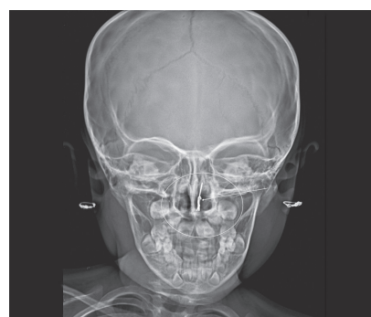
Fig. 3: Skull AP view showing metallic pin in left nostril

Nasal endoscopy was done with a 4-mm 0° rigid endoscope (Hopkins, Germany). The head of the open safety pin was partially