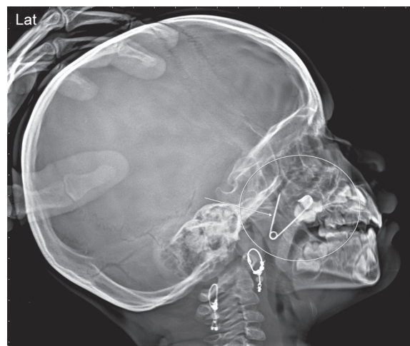
Fig. 4: Lateral view of skull demonstrating the open safety pin in nostril. The keeper shaft rest on floor while point shaft is directed upward

visualized at the floor of the nasal cavity while the end and sharp tip of the spear of pin were not visible. Decongestant nasal drops of xylometazoline 0.05% were instilled in the nose. After the decongestion effect, the head of the safety pin was visualized. An angled House micro-cup forceps (Santosh Surgical, Mumbai, India) (generally used for microscopic ear surgery) was used and the head of safety pin was held in forceps (Fig. 5). The safety pin was pulled anteriorly as possible as a surgeon can manage, but due to the open safety pin and its sharp tip of spear, it was not possible to come out of nasal cavity. Then the head of the pin was held by hemostatic forceps (Santosh Surgical, Mumbai, India) by the assistant. Again with the help of a straight House micro-cup forceps, spear part of the pin was held and both the head and spear part of the pin were pushed slightly posterior to dislodge the sharp end of the spear and then the pin was pulled out by the surgeon and assistant slowly and simultaneously and the safety pin was removed uneventfully (Video 1). There was no mucosal tear or epistaxis seen after the procedure. Review endoscopy was done, and mild oozing was noted near the adenoid region. A small nasal pack was kept in the left nostril, which was removed on the second day. The patient was reviewed on the 5th day; on examination, there was a healthy nasal cavity.