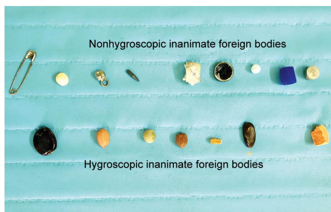
Fig. 1: Inanimate foreign bodies