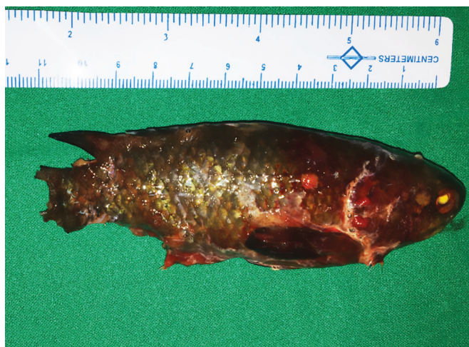
Fig. 3: Fish removed in toto

was immediately shifted to the emergency operation theater. Intravenous line was secured and injection Hydrocortisone 100 mg i.v. was given to reduce the airway edema. We prepared the patient for tracheostomy under local anesthesia.