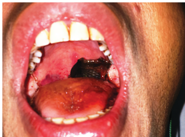
Fig. 1: Live fish in oropharynx. Only tail part of the fish is visible

X-ray neck lateral view demonstrated that the head of the fish was stuck in the cricopharynx and the body was compressing the laryngeal inlet (Fig. 2). The patient