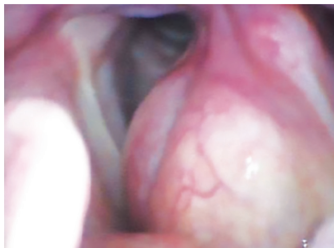
Fig. 1: A large submucosal mass within the left false vocal cord

Flexible nasolaryngoscopy revealed a large smooth mass arising from the left false vocal cord, obscuring the view of the true vocal cord (Fig. 1) with intact mobility of the contralateral side. The case proceeded with computed tomography (CT) scan which showed a 22 × 23 × 28 mm well-defined submucosal mass in the left supraglottic area. It was hypodense, and heterogeneously confined within a capsule with no sign of infiltration or destruction of surrounding structures (Fig. 2). A direct laryngoscopic