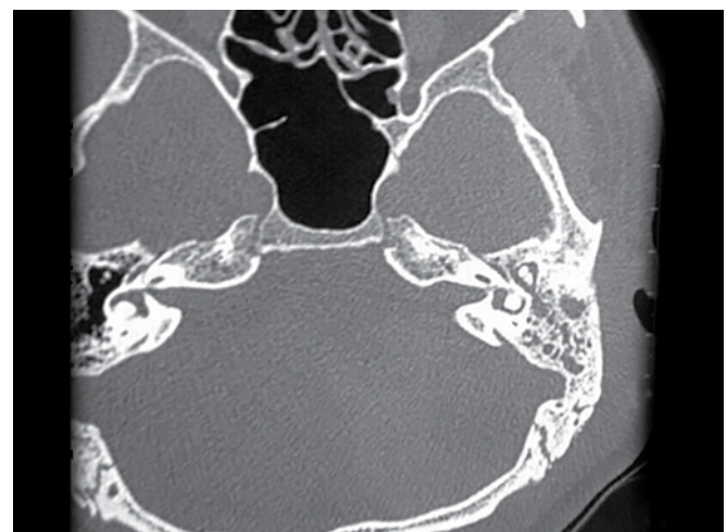
Fig. 3: High-resolution computed tomography temporal bone axial cut showing right blocked aditus