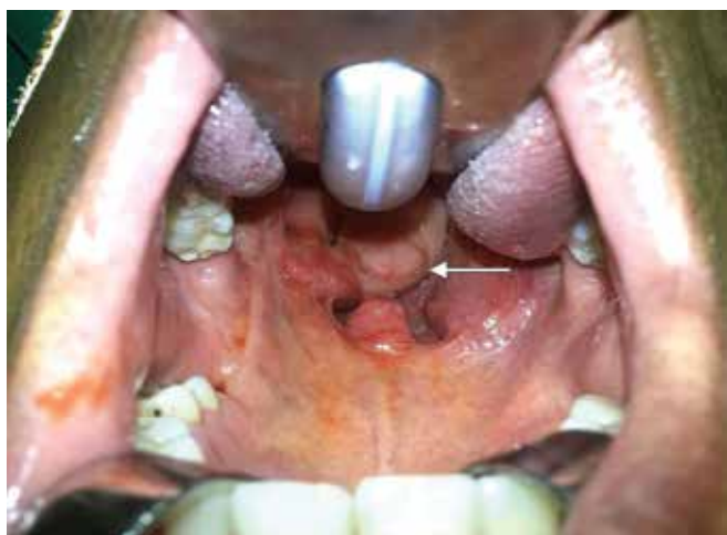
Fig. 1: Clinical photograph showing pedunculated polyp on left tonsil