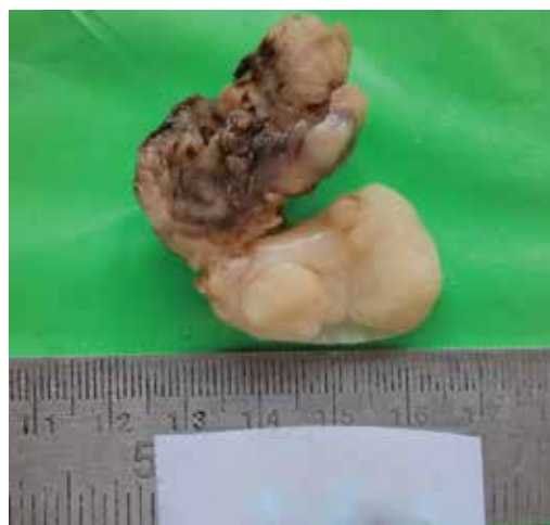
Fig. 2: Gross specimen of left tonsil with pedunculated polyp