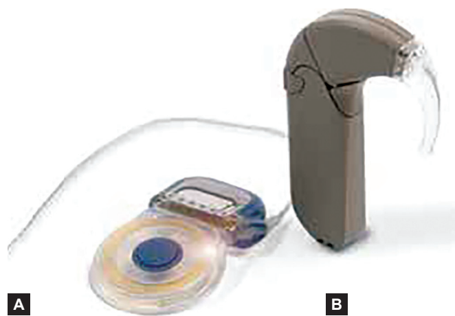
Figs 3A and B: Cochlear Implant: (A) Implant inserted during a surgical procedure and (B) external sound processor worn over the ear