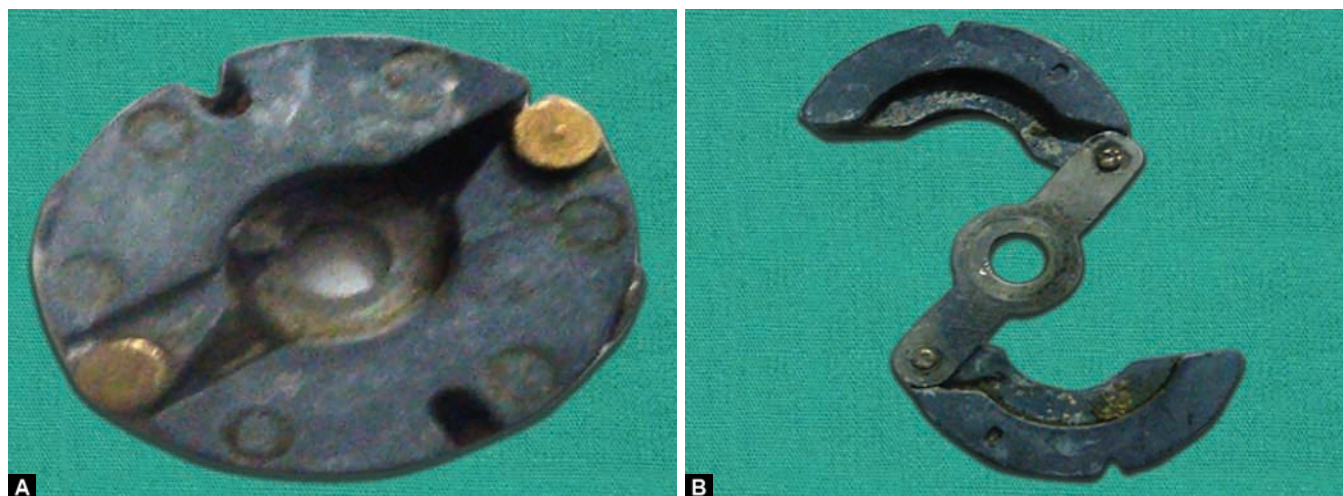
Figs 2A and B: Circular toy (foreign body removed) and (B) circular toy that gets opened up during successful removal with rigid endoscope

The most common types of ingested objects in the esophagus are food-related foreign bodies, such as bones, meat bolus, nuts and seeds. 2 Our case series describes nonfood related foreign bodies. Over 90% of the ingested foreign bodies pass uneventfully through the gastrointestinal tract. 3 Endoscopic treatment or