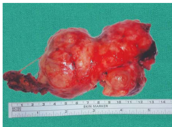
Fig. 3: A 15 x 7 cm whitish, lobulated, glistening mass present on gross examination

Osteochondroma which is a common tumor of axial skeleton is rare to see in maxillofacial region. It can occur at base of the skull, maxillary sinus, zygomatic arch and mandible. 4 In the review of literature, we did not encounter any case report of parapharyngeal osteochondroma. The parapharyngeal space is however, a complex anatomic region located between the mandibular ramus and lateral pharynx and extending as an inverted pyramid from the skull base superiorly to hyoid bone inferiorly. Within this potential space are cranial nerves IX, X, XI and XII, the sympathetic chain, carotid artery, the jugular vein and lymph nodes. Due to the PPS's anatomic complexity, location and