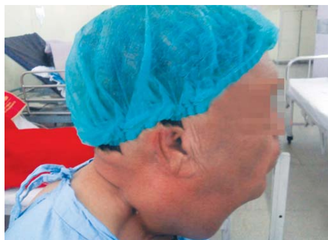
Fig. 1: Lateral view of the patient with a firm, nonpulsatile, nonfluctuant, noncompressible swelling on the right side of neck

Histopathological examination showed two well-defined firm lobulated irregular masses, larger one measured 10 × 7 × 6 cm. Cut sections of the mass showed variegated areas, which were predominantly solid with cystic and hemorrhagic areas. Solid component showed myxoid areas. The smaller piece measured 5 × 4 × 3 cm. Cut sections of which revealed large areas of myxoid component and hemorrhages. Microscopic examination revealed a well encapsulated lobulated mass adherent at one focus to a large sized vein encircled by fibrofatty tissue. The tumor was dominantly composed of islands of benign chondroid cells with abundant amount of myxoid stroma along with large areas of endochondral ossification and hyalinization (Figs 4A and B). No atypia or any epithelial component was identified. Postoperative period was uneventful.