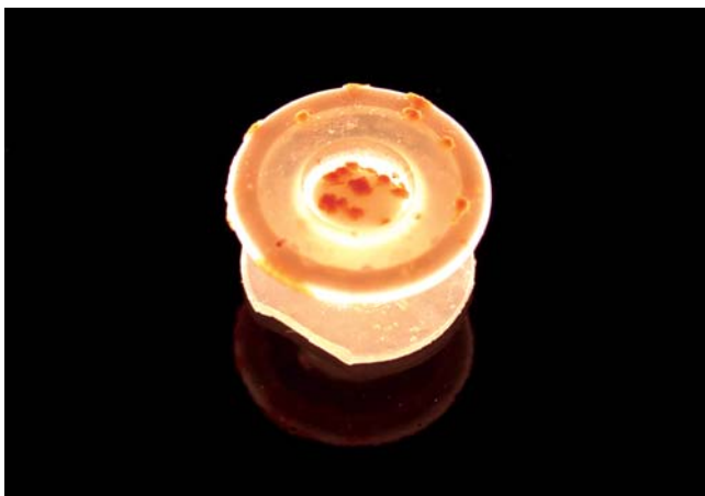
Fig. 2B: Fungal colonization on prosthesis