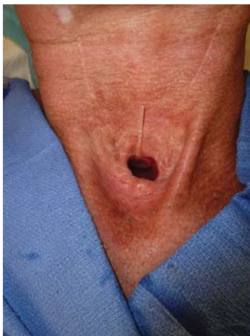
Fig. 1C: Voice prosthesis in place