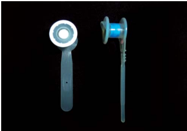
Fig. 2A: Two types of indwelling prostheses

Leakage of fluids through the prosthesis is the most common problem related to the prosthesis itself. 30 Fungal colonization of the valve mechanism is the most common cause of leakage, but can also be caused by an improperly fitting valve (Figs 2A and B). 31 Leakage of liquids around the prosthesis is most often indicative of a poorly healed TEP. Many patients have radiated necks, are hypothyroid, and have other factors associated with poor wound healing. Recurrent cancer is always a possibility and should be thoroughly evaluated.