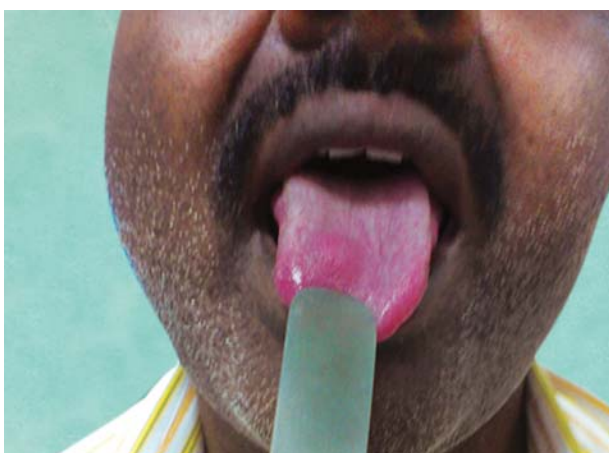
Fig. 1: Firm swelling on the right dorsal aspect of tongue

A 38-year-old male patient presented with a progressive, nontender swelling in the tongue since 1 month. On examination, a firm swelling measuring about 2.5 \times 2.5 cm was noted on the right dorsal aspect of the tongue with no restriction to mobility of the tongue. The mucosa over the swelling was intact (Fig. 1).